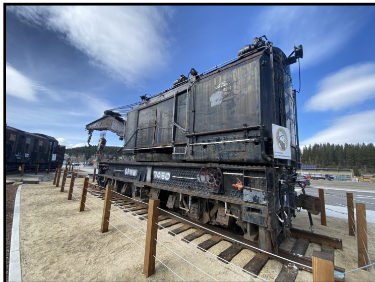
1930 Bucyrus Steam Crane, Awaiting Aesthetic Restoration

Planning efforts for the 1930 Bucyrus Erie Steam Crane aesthetic restoration are also complete. Just under 50% of the necessary project funds have been raised to date and we thank our donors including Union Pacific Railroad. Like the aesthetic restoration of the 1937 ALCO Rotary Snowplow, the crane will require hazardous materials abatement and surface preparation by 8884Abatement and painting by Accurate Painting & Staining. The crane however is costlier due to the overall shape and the height and intricacies of the body and crane boom. The project will require additional time, two types of paint, and scaffolding to efficiently reach and work on all areas of the crane. In addition to the surface work, steel plating will be installed to complete the crane cab, and reconditioning is necessary on the crane lights.