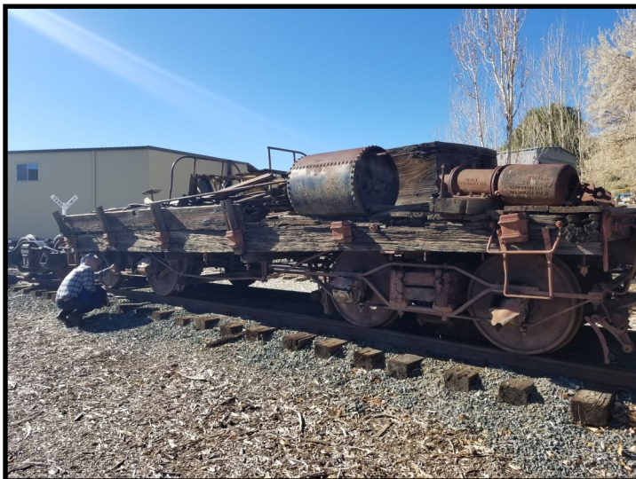
One of Three Hobart Southern Log Cars at NSRM